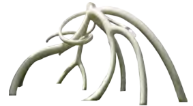
7. Steve Tobin Steelroots, 2008 Steel with white patina