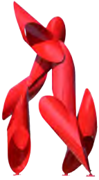
22. Alexander Liberman Argosy, 1980 Painted Steel