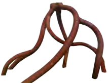
20. Steve Tobin Steelroots, 2008 Steel with rust patina