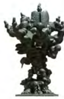
15. Jacques Lipchitz Our Tree of Life, 1973 Bronze