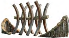
21. Ilan Averbuch Journeys End, 1985 Granite & wood