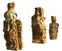
10. Arnie Zimmerman Big Twister, Clown & Crane, 1986 Ceramic