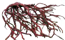
17. Steve Tobin Roots, 2001 Bronze