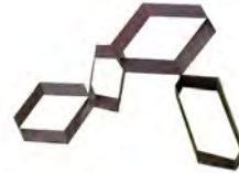
5. Charles Ginnever Forth Bridge, 1979 Corten steel