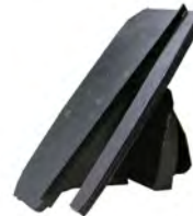
14. Anthony Caro Caramel, 1975 Black steel