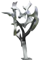
9. Adam Garey Fire Tree, 2000 Steel, stainless steel