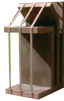
3. Elisa Arimany Third Rail, 1991 Corten steel