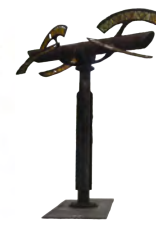
13. Stretch Maverick, 1999 Steel, cast glass